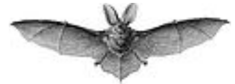
Brown long-eared bat

Common Pipistrelle, Soprano Pipistrelle, Nathusius Pipistrelle, Brown Long-eared, Whiskered, Leisler's, Noctule, Brandt's, Daubenton's, and Natterer's.