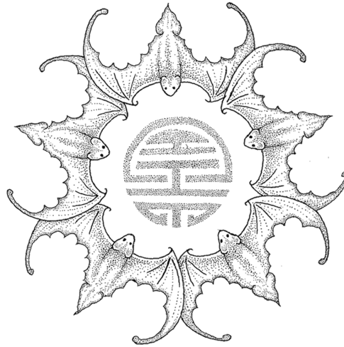
Wu-Fu Chinese Symbol